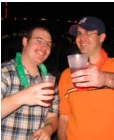
SPFPA is one great union!