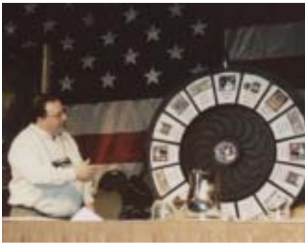
Show me the money! Many delegates took a "spin at the wheel" and won great SPFFPA promotional items!