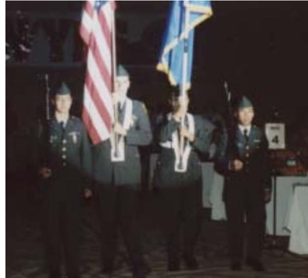
ROTTC Honor Guards proudly opened the ceremonies at the Fourteenth Constitutional Convention.