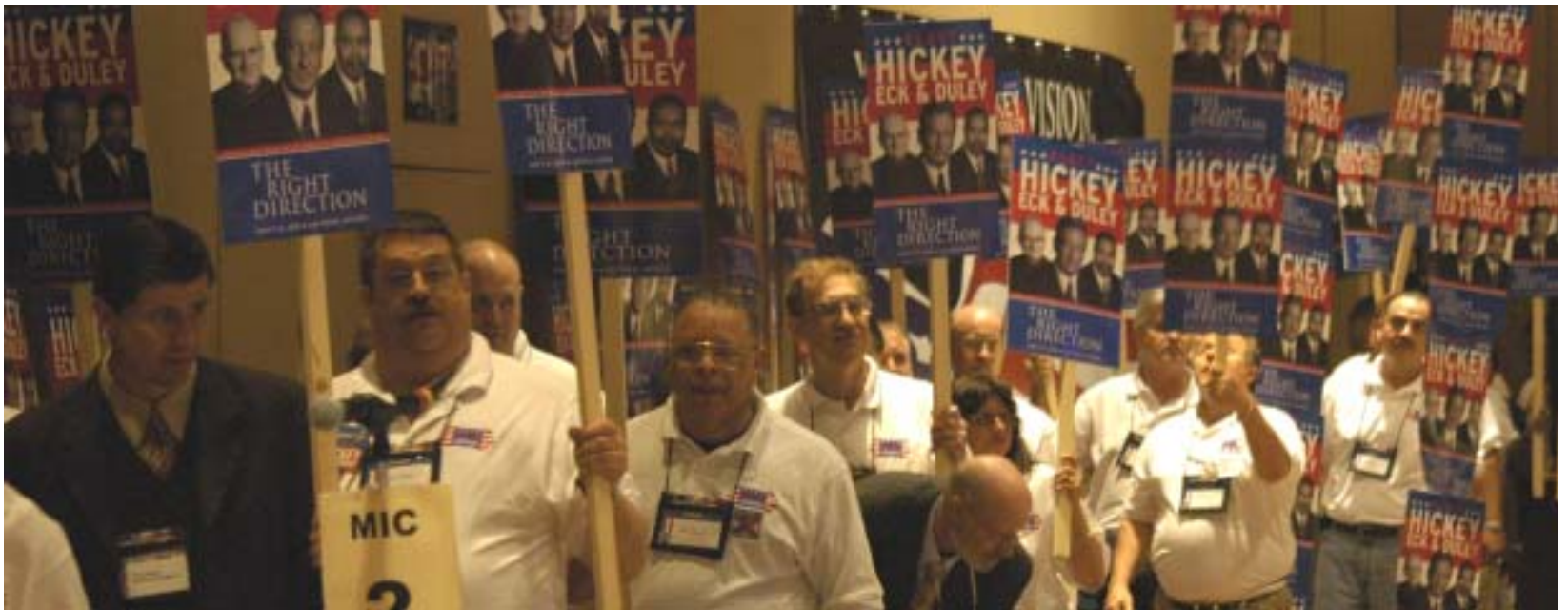
Pumped up members lead the parade to support the “Hickey/Eck/Duley” team to Victory!