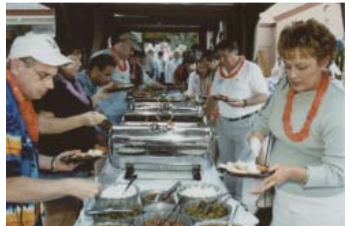
A wonderful buffet was enjoyed by SPFPA members and their guests.