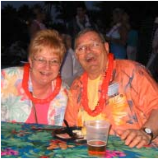
Viva Las Vegas!