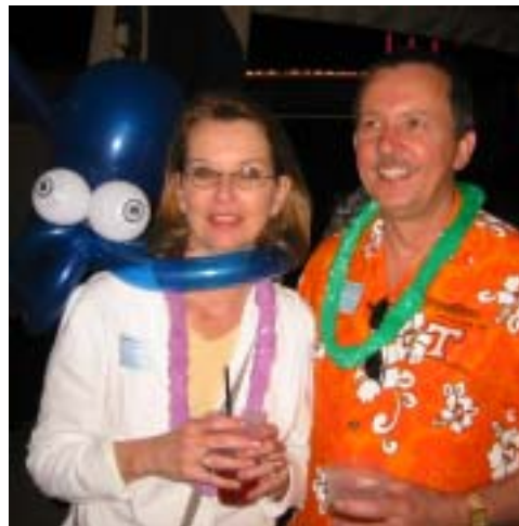
The "Balloon Guy" has been sighted visiting many SPFPA members and guests!