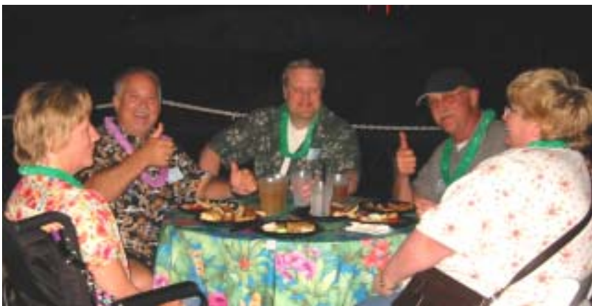
Thumbs up to a great gathering!