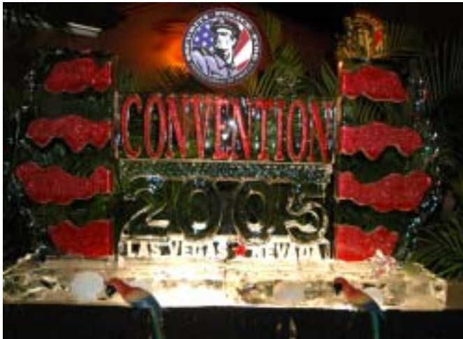
The SPFPA Convention Logo Ice Sculpture was only one of the really "cool" surprises featured at the Island Cocktail reception!

A special reception gave Delegates the opportunity to meet their fellow officers from the United States, Canada and Puerto Rico.