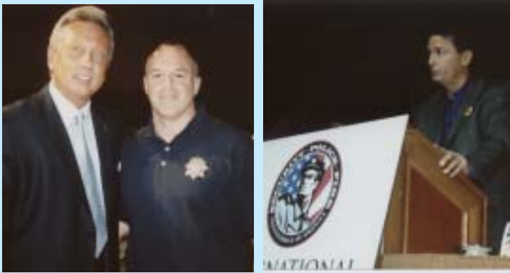
Special guests from the Culinary Workers and Police Union welcomed SPFPA members to Las Vegas!