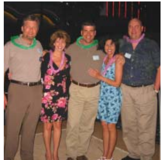
Special times are had by all!