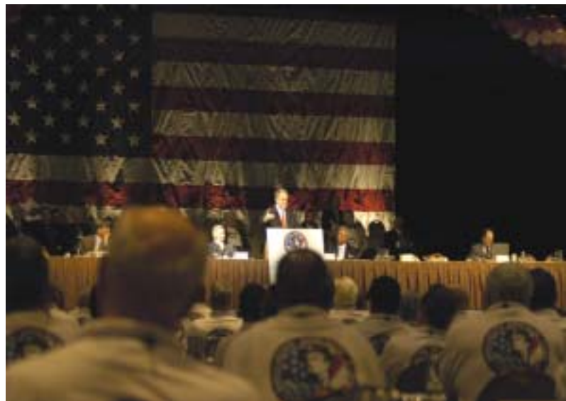
Keynote Speaker David E. Bonior, former U.S. Congressman, Chair of American Rights at Work and Professor of Labor Studies at Wayne State University addressed important issues about "Protecting the Right to Organize, What's at Stake for America's Workforce".