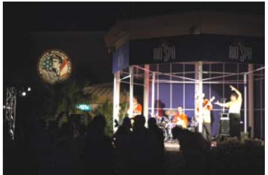
Special entertainment performances by "Hot Lava" and their "Polynesian Dancers" created an ambiance of Island Tropical fun!