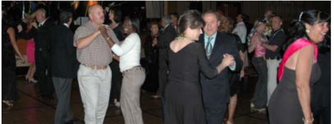
Everyone sparkled at the "Mardi-Gras Gala Dinner Dance". It was great fun for everyone!

International Union, Security, Police and Fire Professionals of America (SPFFPA) 25510 Kelly Road Roseville, MI 48066