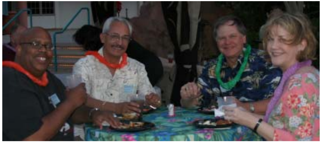
Enjoying the food, fun and great company.